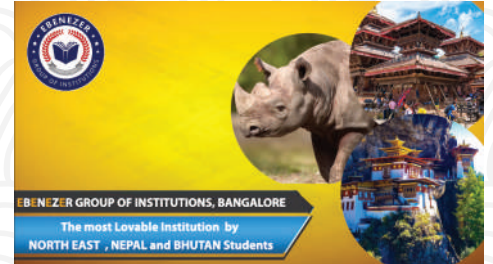
NORTH EAST/NEPAL STUDENTS