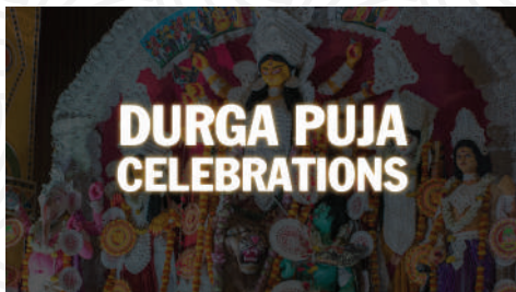
DURGA PUJA CELEBRATION