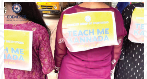
TEACH ME KANNADA