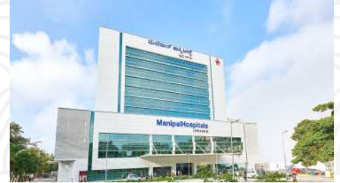
GNM/B.SC CLINICAL POSTING