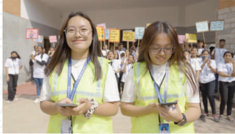
TRAFFIC AWARENESS PROGRAM